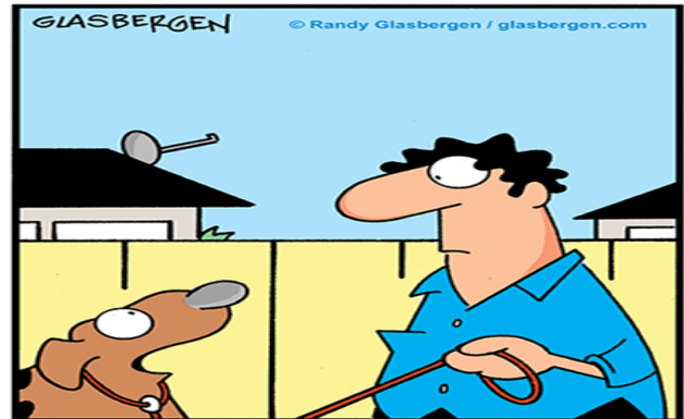
“Explain it to me one more time. Why do you need $200 walking shoes, but I have to do 5 miles in bare feet?”