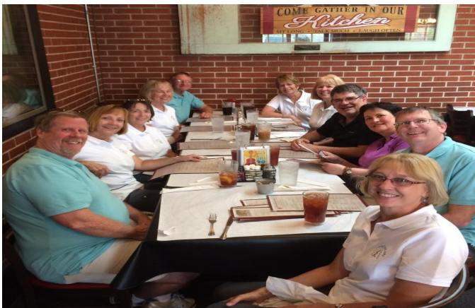
The end of a great day walking and eating!