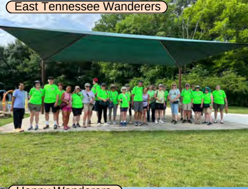
East Tennessee Wanderers